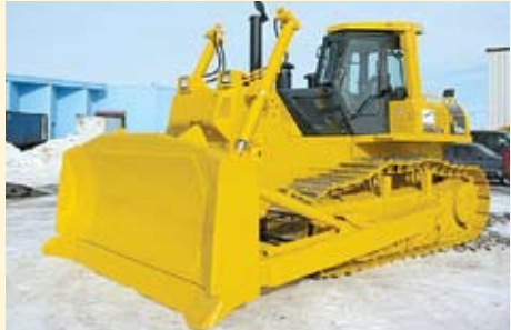
KOMATSU D155AX-5 CRAWLER TRACTOR (ID 20201) WITH ROPS CAB, A/C, HEATER, PRESSURIZER, SEMI-U HYD TILT BLADE ASSY, RIPPER CONTROLS W/PIPING, RIGID DRAWBAR, 26" EXTREME-DUTY PADS .....$249,000