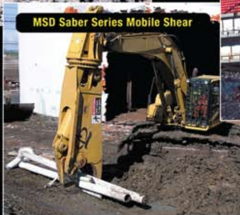
MSD Saber Series Mobile Shear

Whether tearing down a major league ballpark or working the demands of a production scrap processing facility, Stanley LaBounty and its dedicated dealer network are committed to maximizing safety, productivity and profitability. Call us or your authorized Stanley LaBounty dealer today.