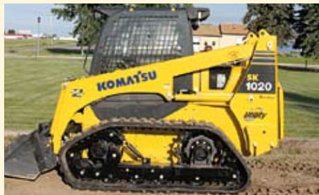
KOMATSU SK1020 SKID STEER (ID 20054) WITH 83-HP TURBO DIESEL ENG, ONE AUX HYD CIRCUIT, SUSPENSION SEAT, SOLIDEAL 12X16.5 HD FLOTATION TIRES - WIDE CONFIG, ADDL REAR CWT, CAB SLIDING WINDOWS, FRONT DOOR (SLIDES OVERHEAD) W/HEATER/DEFROSTER AND LOCKING HANDLE, A/C FOR CAB, WIPER/WASHER, HYD DRAIN FOR HAMMER, MASTER ELEC DISCONNECT SWITCH, RIDE CONTROL, 12-VOLT ELEC OUTLET, REAR HALOGEN WORK LIGHTS, 40-AMP ALTERNATOR, TWO-SPEED HYDROSTATIC DRIVE, INTAKE PREHEAT SYTEM, DRY-TYPE AIR FILTER, JOYSTICK CONTROLS, WET-DISC PARKING BRAKES, BACKUP ALARM, ORFS HYD PIPING CONNEC, AUTO POWER CNTRL, (ANTI-STALL)..... $45,000