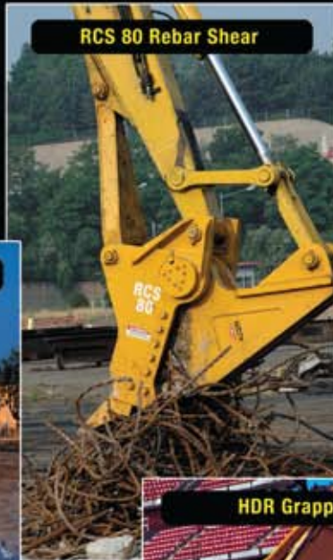
RCS 80 Rebar Shear