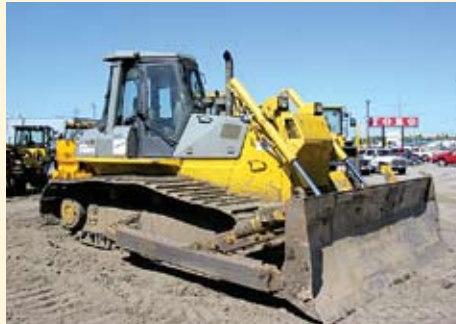
KOMATSU D65PX-12K CRAWLER DOZER (ID 13786) WITH 36" SINGLE-GROUSER SHOES, WATER SEPARATOR, FRONT PULL HOOK, ROPS CANOPY, STEEL CAB, A/C, HEATER, DEFROSTER, PRESSURIZER, FABRIC SUSPENSION SEAT, REARVIEW MIRROR, RIGID-TYPE DRAWBAR HITCH, 13' POWER TILT AND PITCH DOZER ASSEMBLY, ADDL REAR WORK LIGHTS, FRONT/CENTER/REAR TRACK ROLLER GUARDS, FRONT/SIDE/REAR WASHER/ WIPERS, PRECLEANERS FOR ENGINE AND CAB AIR, BACKUP ALARM AND HORN..... $85,000