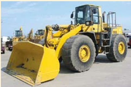
KOMATSU WA450-3 WHEEL LOADER WITH ROPS CAB, A/C, HEATER, DEFROSTER, 26.5R25 RADIAL TIRES, NEW 5-CU.-YD. BUCKET WITH BOCE, PROHEAT STARTING AID SYSTEM..... $POR