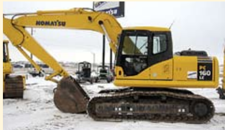
KOMATSU PC160LC-7 (ID 13925) HYDRAULIC EXCAVATOR WITH 60 AMP ALTERNATOR, ALL-WEATHER CAB, TINTED SAFETY GLASS, PULL-TYPE FRONT WINDOW, LOCKABLE DOOR, INTERMITTENT WIPER/WASHER, AM/FM RADIO, HEATER, A/C, DEFROSTER, HOT/COLD STORAGE BOX, HYDRAUMIND SYSTEM, FULL HYDROSTATIC WITH CLOSED-CENTER LOAD SENSING AND ENGINE SENSING, 7-SPOOL CONTROL VALVE (INCL 1 SERVICE VALVE), 6,280-LB COUNTERWEIGHT, 31.5" TRIPLE-GROUSER SHOES, 16' 11" BOOM, 9' 6" ARM, PATTERN CHANGE VALVE . . . $125,000