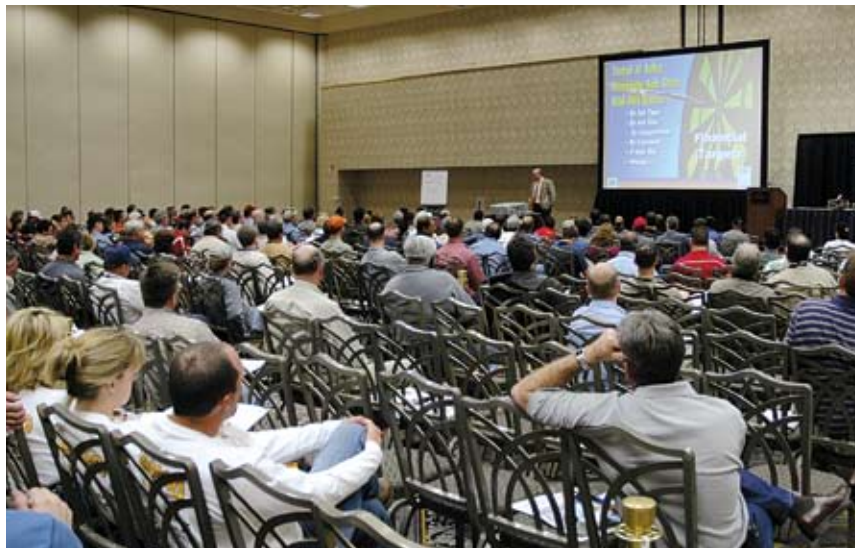
CONEXPO is more than just an equipment showcase. Attendees can learn more about the construction industry through educational programs in such areas as aggregates, asphalt, project management, equipment management, personal development and safety.

industry. We see this as a way to generate interest among youth and highlight for them the careers available in construction."