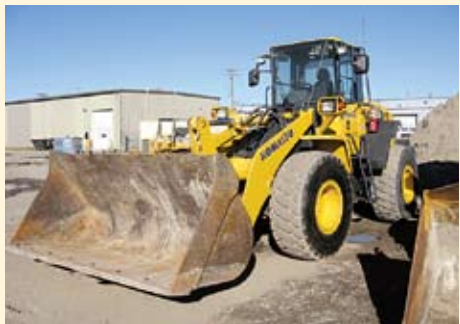
KOMATSU WA320-5L WHEEL LOADER (ID 22937) WITH CAB, A/C, HEATER, DEFROSTER, CLOTH SUSPENSION SEAT, MONO-LEVER CONTROL (2-SPOOL), JRB HYDRAULIC QUICK COUPLER, JRB 3.25-CU.-YD. GP BKT WITH BOCE (108" WIDE), BRIDGESTONE 20.5R25 RADIAL TIRES . . .$112,500