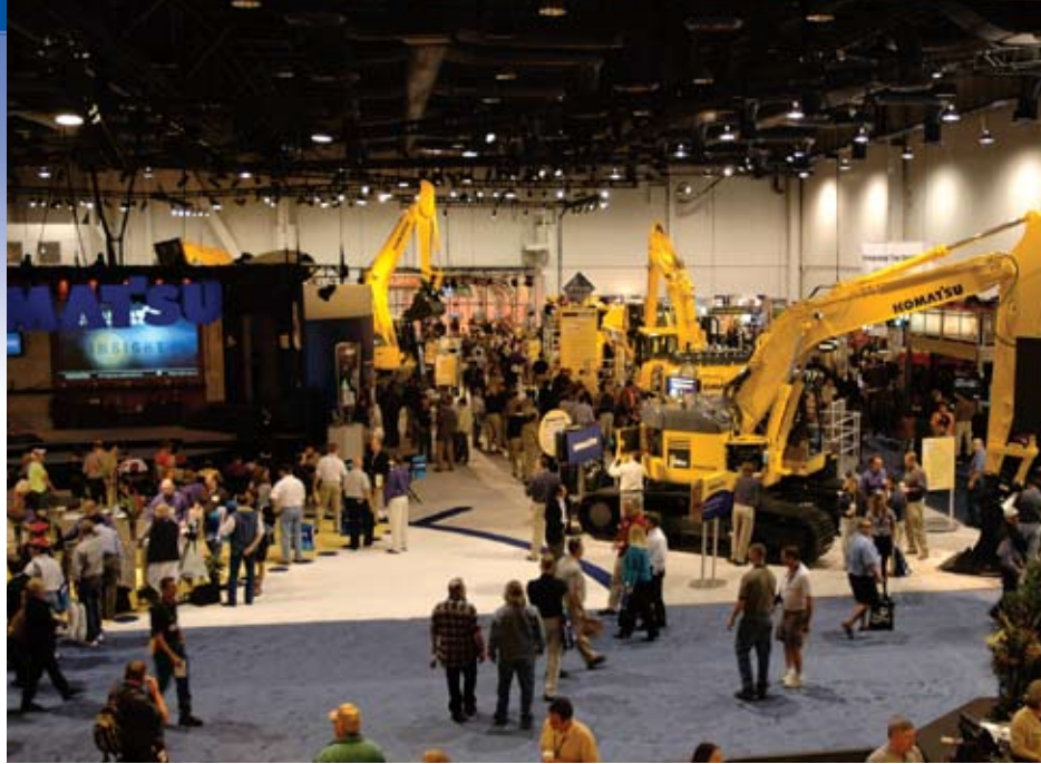
Komatsu always has one of the largest displays at CONEXPO. Twenty-four products will be available for attendees to check out at the 2008 event.

"We're very excited about the new features, and we believe that attendees will find them informative and helpful," said Tanel. "The Construction Challenge is one area we're particularly looking forward to as it showcases young people involved in the construction