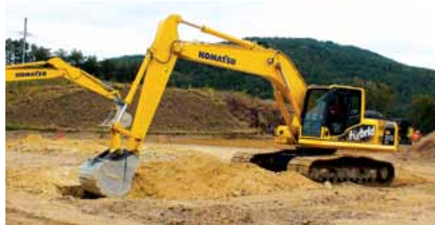
Equipment users tried out many Komatsu machines, including the new HB215LC-1 hybrid excavator and the popular WA500-6 wheel loader.