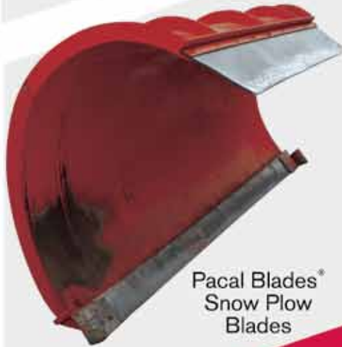
Pacal Blades ® Snow Plow Blades