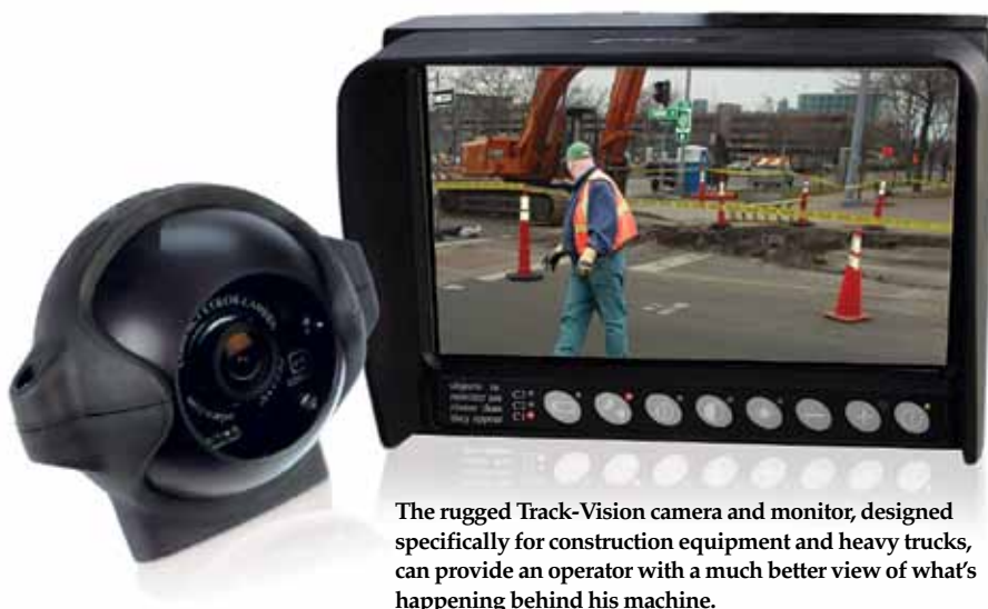
The rugged Track-Vision camera and monitor, designed specifically for construction equipment and heavy trucks, can provide an operator with a much better view of what's happening behind his machine.

For more information on the Track-Vision camera system that will work best for your job, contact your General Equipment Customer Service and Support Rep or the nearest branch parts or service department. ■