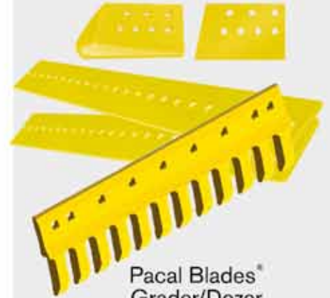
Pacal Blades ® Grader/Dozer Blades

Moving Dirt, Rock, Snow or Crushed Aggregate – Maximize Production with ESCO and GENERAL EQUIPMENT & SUPPLIES, INC.