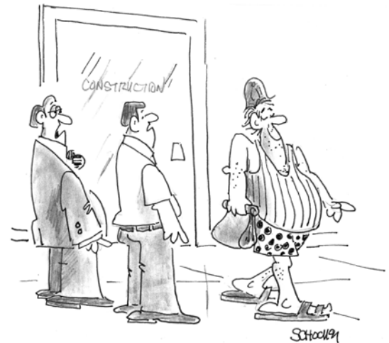
"That's it, no more casual Fridays!"