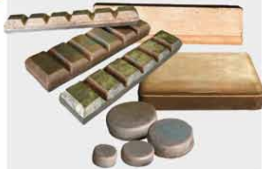
Universal Wear Solutions