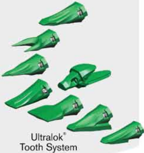
Ultralok ® Tooth System