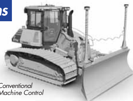
Conventional Machine Control