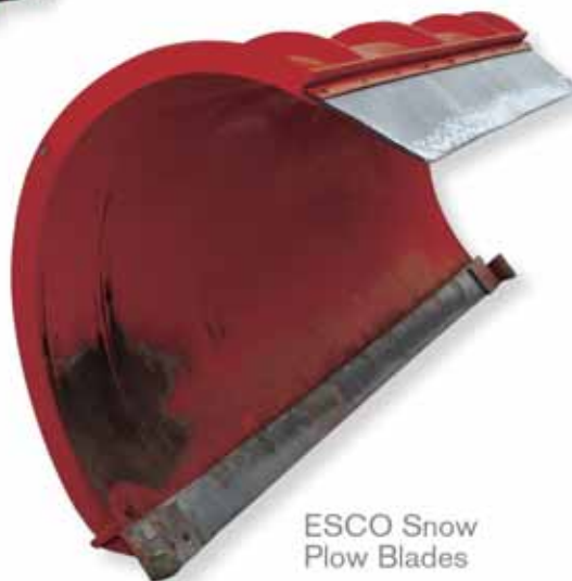
ESCO Snow Plow Blades