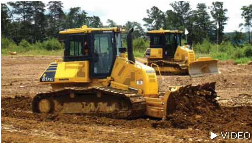
Komatsu showcased its intelligent Machine Control dozers, including D61PXi-23 and D39PXi-23 models, during an iMC experience at its Training & Demonstration Center in Cartersville, Ga.

Komatsu also highlighted the latest Topcon technology for productivity reporting and remote machine monitoring. Attendees could see the software that’s designed to work with GPS systems to track production in real time. ■