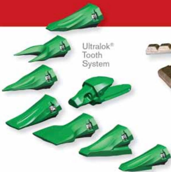
Ultralok ® Tooth System