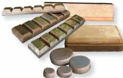
Infinity ® Bi-Metallic Wear Products