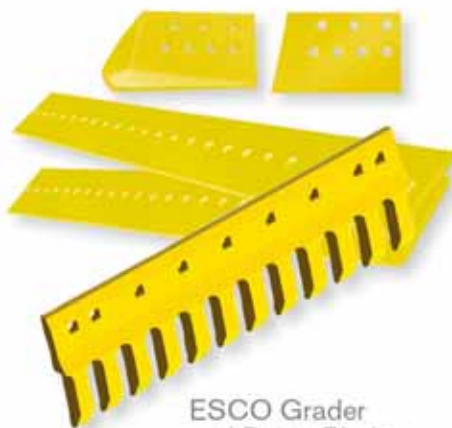
ESCO Grader and Dozer Blades