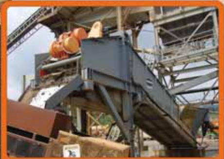
WASHING, CLASSIFYING & DEWATERING