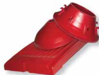
ESCO Crusher Wear Parts