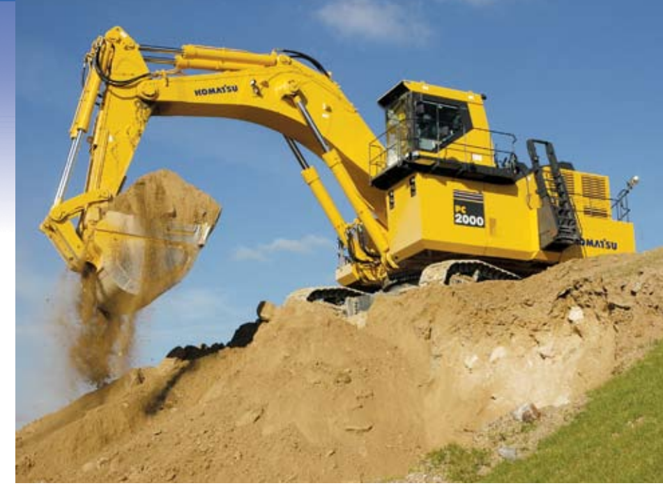
The 956-horsepower PC2000-8 (above) is a new machine that replaces the PC1800 in the Komatsu excavator lineup. Similarly, the new PC800LC-8 (below), has more horsepower and greater stability than the PC750 it replaces.