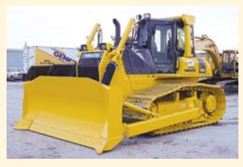
KOMATSU D65WX-15 CRAWLER TRACTOR (ID M13582) POWERED BY KOMATSU S6D125E-3 DIESEL ENGINE EQUIPPED WITH CAB, AIR, FABRIC SUSPENSION SEAT, AM/FM RADIO, 32" SINGLE-GROUSER SHOES, SEMI-U TILT DOZER ASSEMBLY, HYDRAULICS FOR REAR EQUIP, ADDITIONAL WORK LIGHTS FRONT AND REAR, KOMATSU 3-SHANK PARALLELOGRAM RIPPER......$175,900