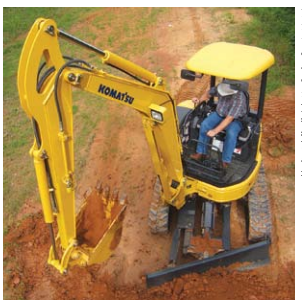
In 2006, Komatsu introduced the fourway, power-angle blade option on its PC35MR-2 and PC50MR-2 compact excavators to improve flexibility and backfilling productivity. This year will see the introduction of a standard thumb-mounting bracket on the dipper arm, as well as an expanded range of attachments.

With everything they have to offer, there's another reason to check out the lineup of Komatsu compact excavators. Now is the time to take advantage of Komatsu's zero-percent retail finance plans. ■