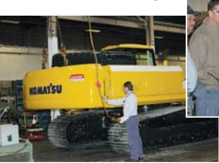
Using an overhead crane, a worker installs the counterweight on a PC300LC-7 at the Chattanooga plant.

More than 300 employees work at the Chattanooga Manufacturing Operation. Many of those workers have been at the plant more than 15 years.