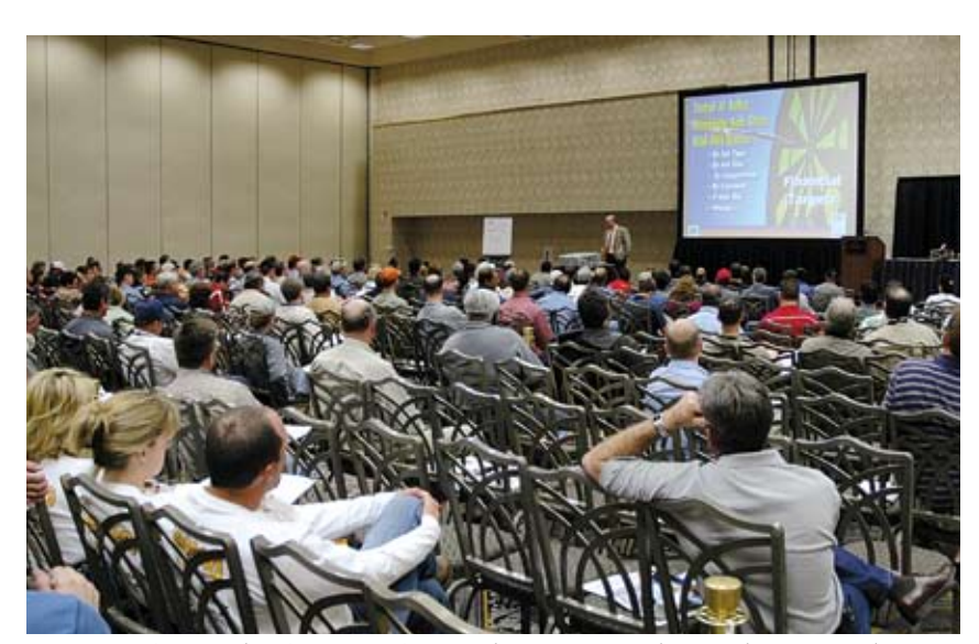
CONEXPO is more than just an equipment showcase. Attendees can learn more about the construction industry through educational programs in such areas as aggregates, asphalt, project management, equipment management, personal development and safety.

industry. We see this as a way to generate interest among youth and highlight for them the careers available in construction."