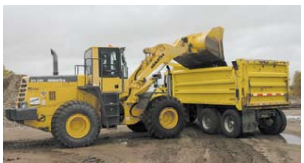
Komatsu WA380 wheel loaders play a big role in Earl Strande Excavating's operations, such as moving material and loading trucks at one of the company's pits near Fergus Falls, Minn.