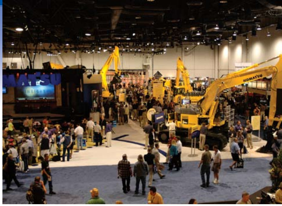
Komatsu always has one of the largest displays at CONEXPO. Twenty-four products will be available for attendees to check out at the 2008 event.

"We're very excited about the new features, and we believe that attendees will find them informative and helpful," said Tanel. "The Construction Challenge is one area we're particularly looking forward to as it showcases young people involved in the construction