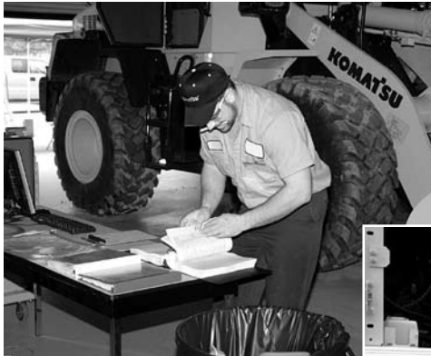
At the ATC, top technicians from across the country compete against each other in a troubleshooting skills contest. Komatsu training personnel (below) judge contestants based on their ability to properly use all information to reach the correct diagnoses in the shortest time.