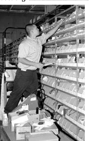
Komatsu recently completed its tenth regional parts depot. The depots are strategically located to ensure parts are readily available to distributors and customers throughout North America, the next day in most cases.