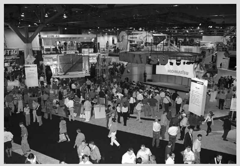
MinExpo will be held Sept. 22-24 at the Las Vegas Convention Center.

Komatsu will be among more than 1,000 exhibitors displaying the latest in mining equipment, technology, parts and service, as well as other items, at MinExpo, Sept. 22-24 at the Las Vegas Convention Center.