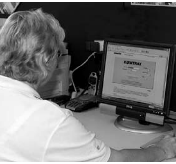
Komatsu's KOMTRAX machine-monitoring system allows equipment users to track machine performance and maintenance items.

done by talking with equipment users to find out how Komatsu machinery can improve their business. They also expect that machinery to be backed up with excellent support, no matter where they work. So we're working to ensure consistent product support throughout our distributor network, including recertifying service technicians.