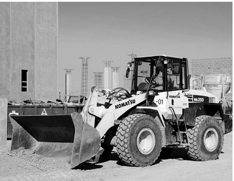
Recent data show that nonresidential construction is likely to post gains in several categories, according to AGC Chief Economist Ken Simonson.

nonresidential building, specialty trades, plus heavy and civil engineering — were up by 1,300.