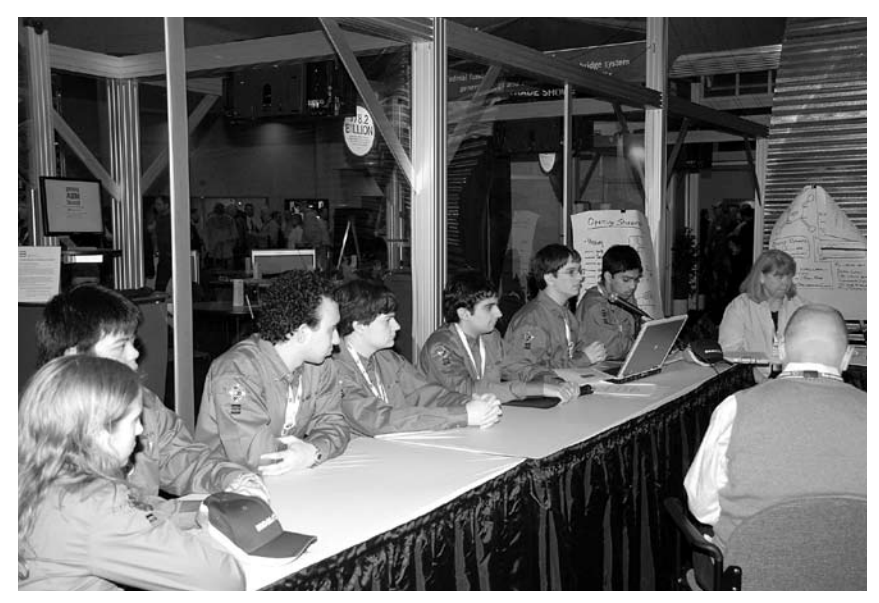
Komatsu's Construction Challenge team answers questions during the Infrastructure Dialog portion of the competition, which also included Equipment & Careers and Road Warrior segments. The high school group was from North Springs Charter School in Atlanta, Ga.