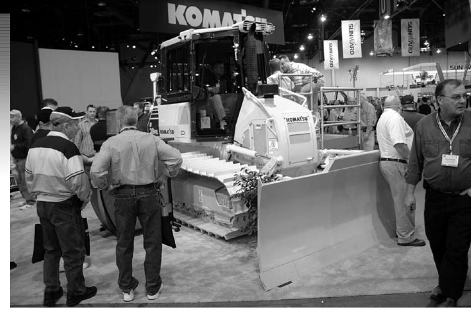
Komatsu introduced new products including the D39EX-22 dozer, which features better visibility and a Tier 3 engine for maximum production with less fuel usage and lower emissions.

infrastructure awareness, especially roads/ highways and water/sewer; an Equipment & Careers segment that required the team to develop an interactive educational resource or product; and a Road Warrior segment that required building and using construction equipment.