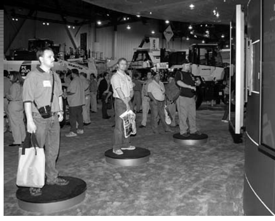
Attendees got a good look at how Komatsu's KOMTRAX remote machine-monitoring system works by standing on an interactive pod that activated a display screen of information (above). They could further see how the system works by viewing machines being monitored via computer in real time (below).