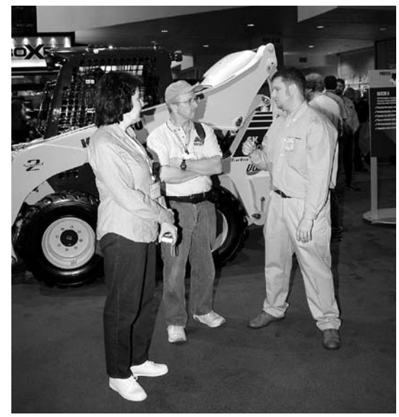
Komatsu personnel were on hand to answer attendees' questions about Komatsu equipment.

infrastructure awareness, especially roads/ highways and water/sewer; an Equipment & Careers segment that required the team to develop an interactive educational resource or product; and a Road Warrior segment that required building and using construction equipment.