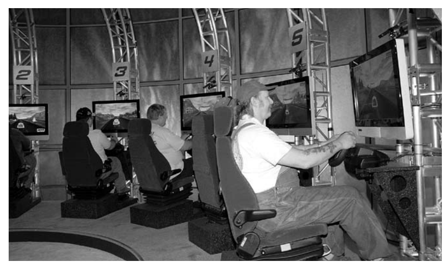
Visitors to Komatsu's display could compete against other drivers in a simulated driving contest.