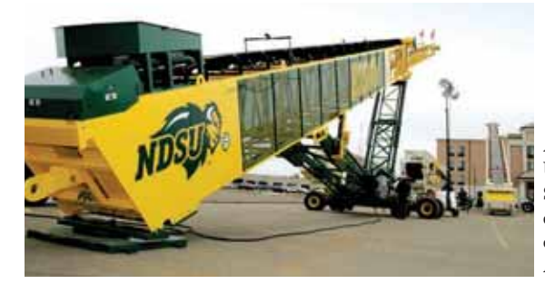
A North Dakota State University-themed Superior 36X150TSFD extends over the display area at the 2016 Aggregate Expo.