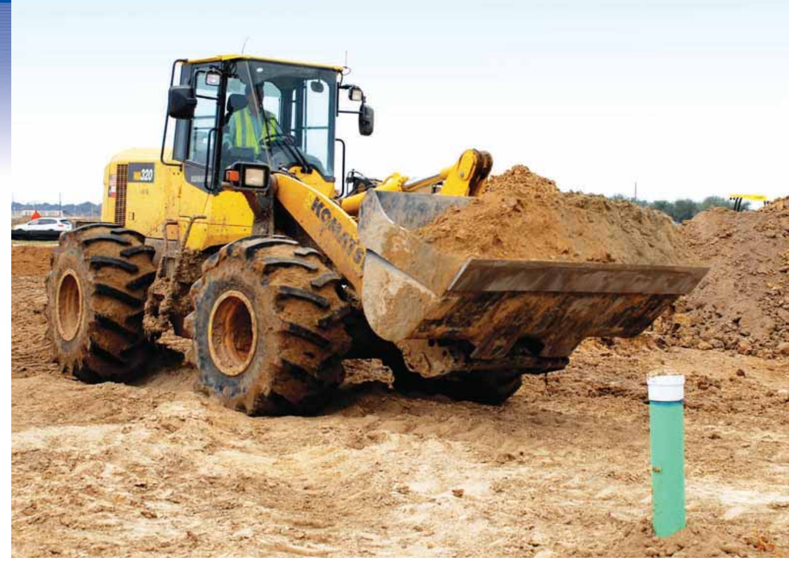
PVC and concrete pipe is an alternative to lead and other metal service lines that are subject to corrosion. Kansas City created a program to replace 28 miles of pipe each year after suffering more than 1,850 water-main breaks in 2012. Most of Kansas City's existing infrastructure was made of cheap metal and installed during and after World War II.

breaks occur each day in the United States. Since 2000, there have been more than 5 million breaks. Corrosion costs more than $50 billion annually; that's about $652 billion over the past 15 years.