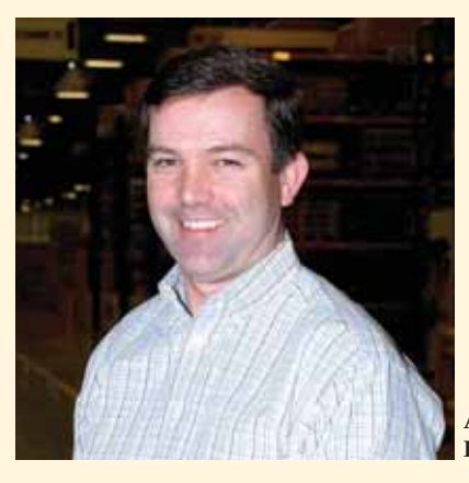
This is one of a series of articles based on interviews with key people at Komatsu discussing the company's commitment to its customers in the construction and mining industries – and their visions for the future.

ANSWER: When machines are down, customers are losing money. We understand that, so our response is critical. The faster they get the parts, the faster they can be back up and running. Many customers tell me that service after the sale is a huge factor in what brand of equipment they choose, so we obviously place a heavy emphasis on timely parts support.