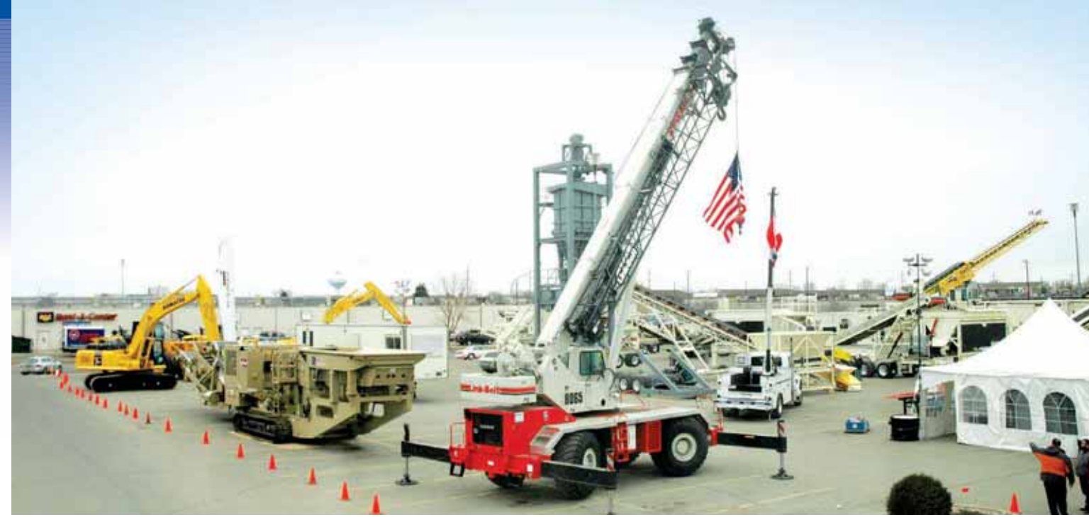
General Equipment & Supplies, Inc.'s Aggregate Expo is growing in popularity within the aggregate industry. More than 450 people attended the 2016 event at the Holiday Inn in Fargo, which featured classes, manufacturer booths and a $20 million equipment display.