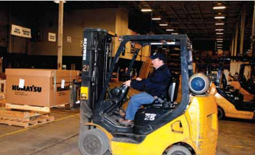
Komatsu's Ripley Parts Operation (RPO) is the central parts warehouse for North America and Latin America. Its inventory includes items for construction, forestry, industrial press and mining support. It also includes parts for Komatsu forklifts, like the one pictured here, which RPO personnel use at the warehouse.

ANSWER: We maintain a good deal of inventory for machines dating back a decade or more, so we likely have the needed parts on hand. If we don't, we can source parts from trusted suppliers. We will do everything we can to make sure customers get what they need.