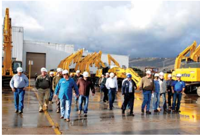
Attendees tour Komatsu's Chattanooga Manufacturing Operations Center in Chattanooga, Tennessee.

Komatsu had 31 machines available for demonstration at its Demo Days in Cartersville, Georgia, February 23-25.