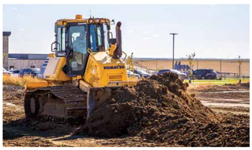
On a job site, an operator moves material with a Komatsu D61PXi intelligent Machine Control (iMC) dozer.

What started with a shovel and a Mazda pickup has now grown into a business that operates with five GPS-controlled scrapers, a blade, and a Komatsu intelligent Machine Control (iMC) dozer along with many other trucks and pieces of equipment. The decision to bring in iMC machines was largely due to efficiency, according to Trent.