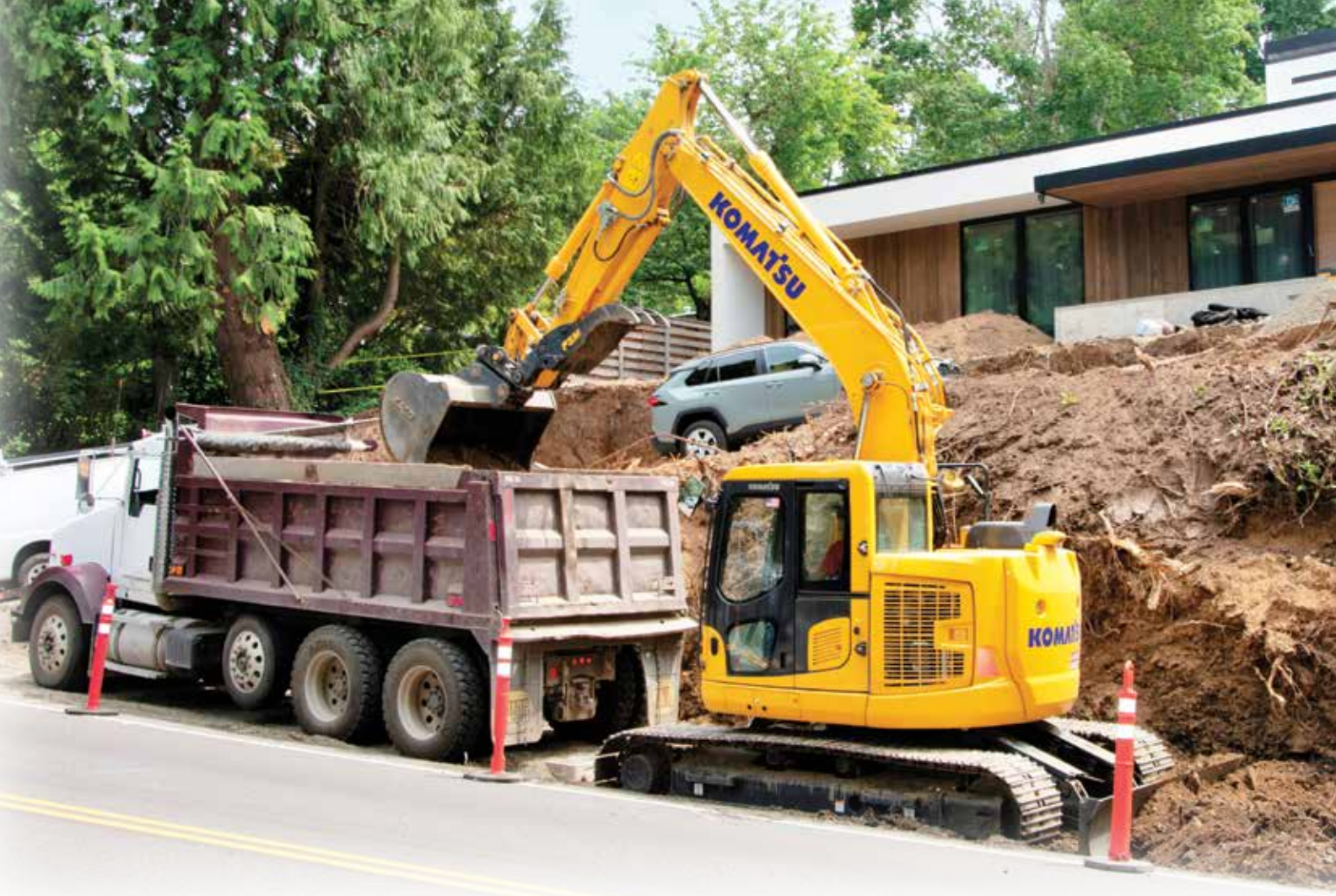
Komatsu manufactures eight tight tail swing models, ranging in size from the approximately 6,800-pound, 24.4-horsepower PC30MR-5 to the roughly 54,000-pound, 165-horsepower PC38USLC-11. "Tight tails allow operators to be more efficient because they typically have better situational awareness and can concentrate on the task at hand while reducing the chances of swinging into an obstruction or into a lane of traffic," stated Kurt Moncini, Senior Product Manager, Komatsu. "They are great for a variety of tasks in urban areas, as well as others, where space is limited."

tail swing. The good news is that most are already plumbed and ready for attachments."