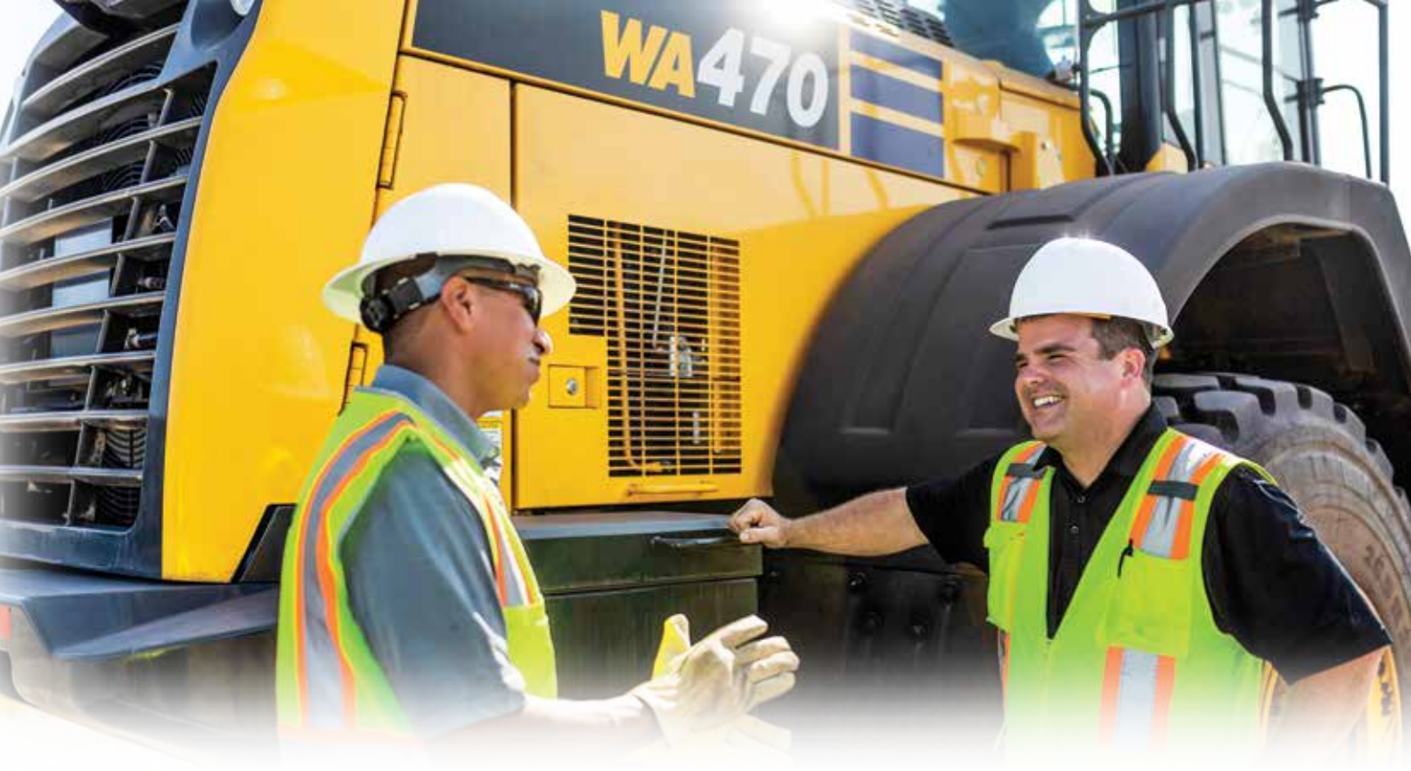
From benefits to leadership development and training, showing that you want to take care of your employees and help them grow is an important aspect in internal retention to overcome labor shortages in the construction industry.

that they don't do all week, so it's something different for them. It's a two-way street that we provide the best job and environment for them to work in."