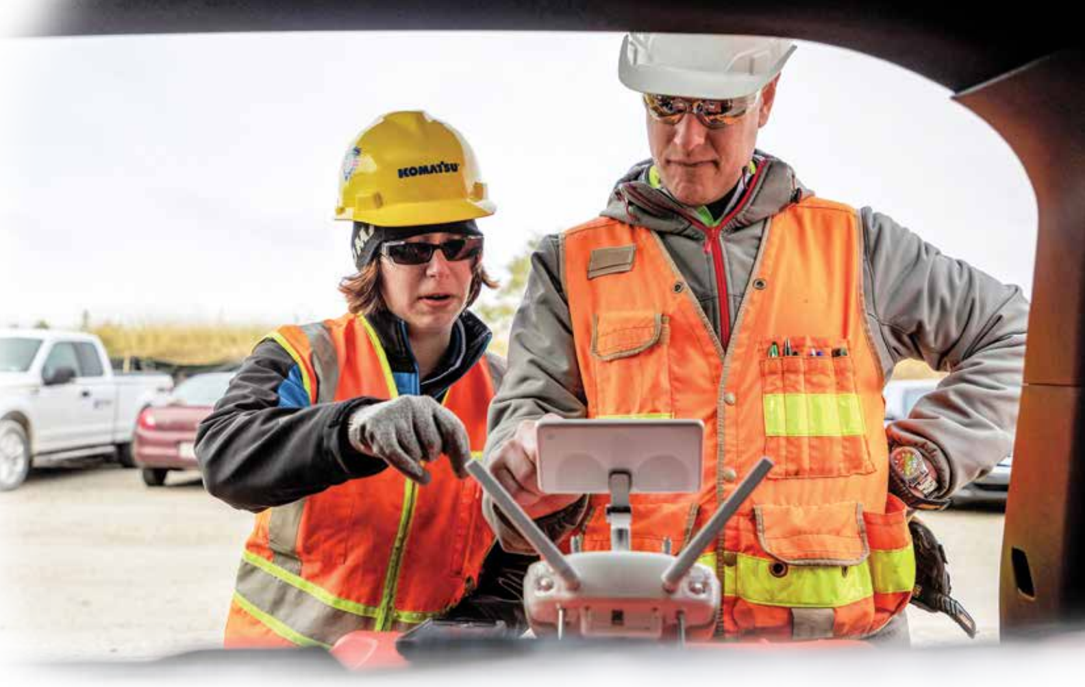
With a drone, a company can quickly and accurately collect objective data of its job site, and that information can be used to help increase productivity and efficiency in the field.

fleets accordingly to help increase production and have more precise data collection throughout the process.